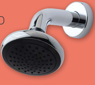
la SH1 UK - 72966-CP

Single mode handset with removable spray plate and adjustable head angle. 8 litres / min flow regulator supplied.